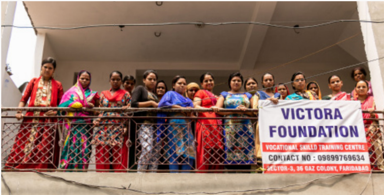
Our Center at 36 Gaz Colony, Sector - 3, Faridabad