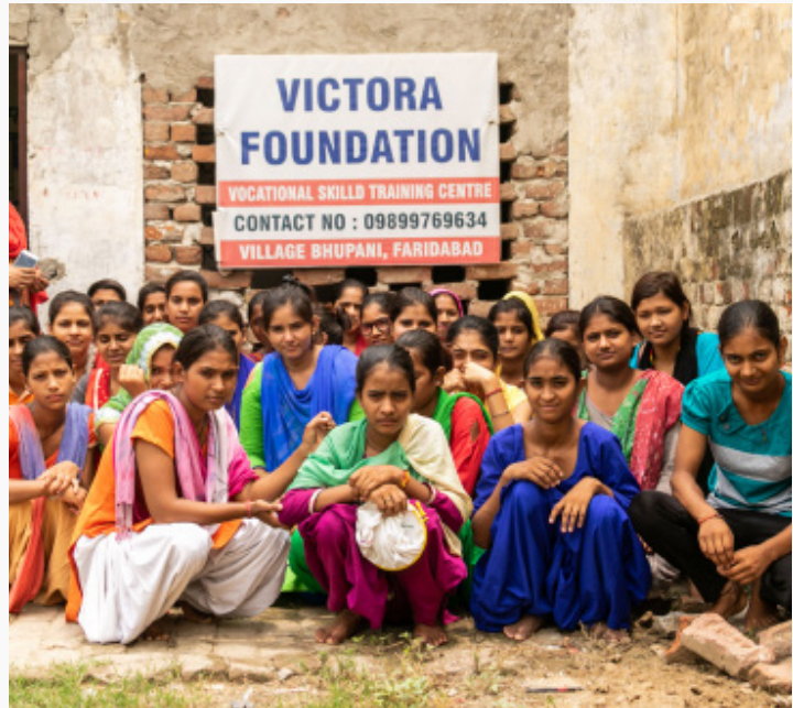
Our Center at Village Bhupani, Faridabad