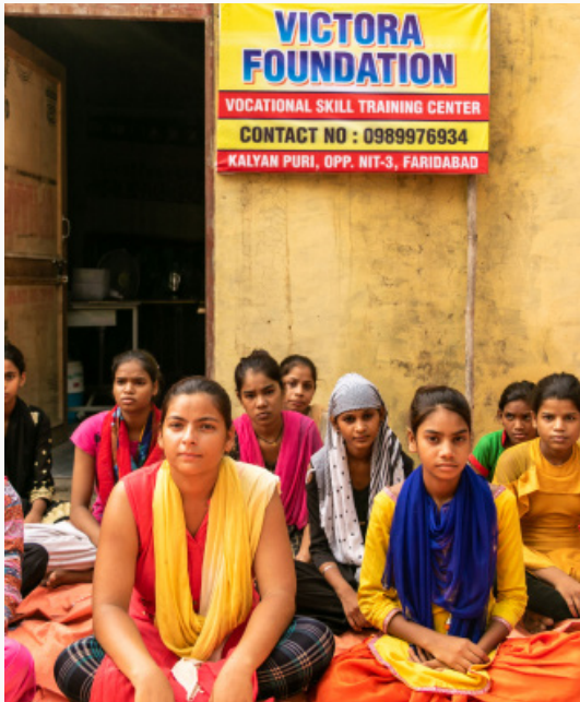
Our Center at Kalyan Puri, NIT - 3, Faridabad