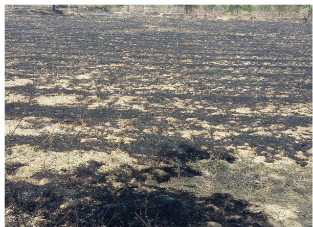
Agricultural field being fired for Podu cultivation in Sundargarh, Odisha