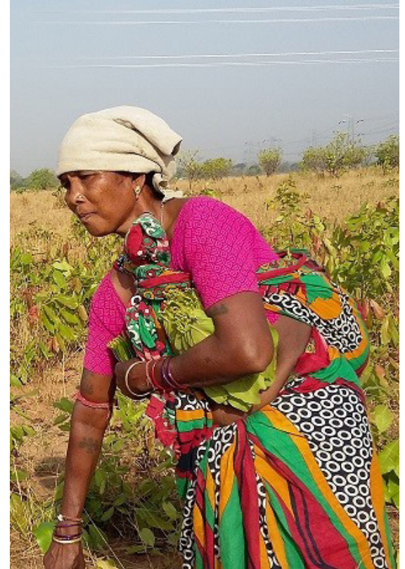
A woman collecting Tendu leaves for livelihood, Sundargarh, Odisha

Data for this brief are drawn from a qualitative study conducted between April and June 2017 in a rural setting in Sundargarh district of Odisha, which is highly vulnerable to heatwaves (Map 1). Information was collected from a range of stakeholders through 23 in-depth interviews (IDI) and two focus group discussions (FGD). IDIs were conducted among community members (e.g., farmers, daily wage laborers,