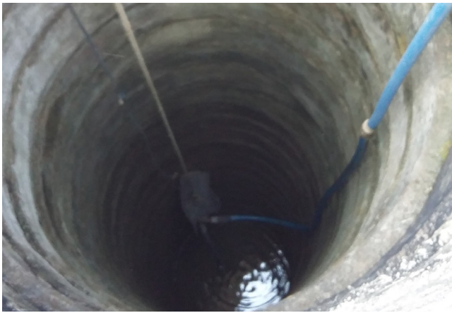
Decreased water level in well, Sundargarh, Odisha

actions by humans (an anthropogenic effect)--were cited as the main reasons for the changing climate and increasing temperature. While heatwaves are not a new phenomenon for Odisha, people said rising temperatures have made the heatwaves worse.