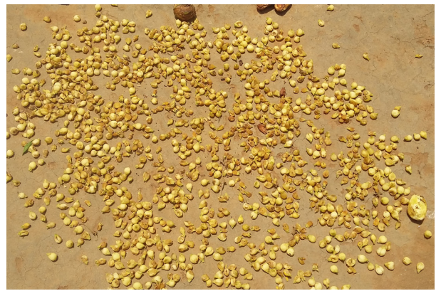
Mahuwa flower and mango collected by villagers for livelihood, Sundargarh, Odisha

People also reported suffering psychologically and feeling depressed because of these health and financial consequences perceived as attributable to heatwaves.