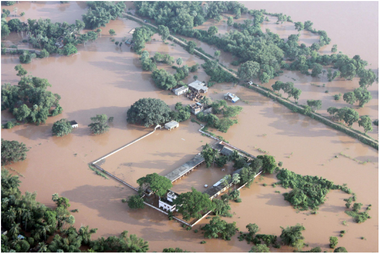
Flooding in Odisha, India.

“Crop loss is a major challenge for us due to flooding. As the yield of grains from agriculture field is affected, my purchases from the market increases. It obviously affects my household food security and we have to compromise our food consumption.” (Male Farmer, 70 years, IDI)