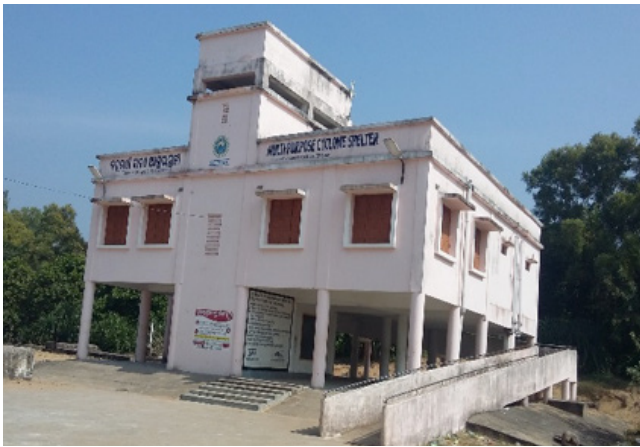
Multipurpose Cyclone Rehabilitation Center at Padmapur village, Jagatsinghpur, Odisha.