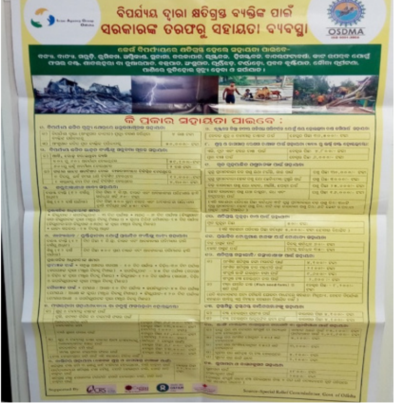
List showing assistance provided by the government of Odisha for people affected by the disaster.

Participants described water, sanitation and hygiene conditions in the community being badly affected by cyclones and floods as a result of the invasion of saline water in the land area that affected drinking, cultivation, and daily life. The impact of the 1999 super cyclone was so heavy that the cultivable lands became unusable for years and people were also unable to find good sources of drinking water. When cyclones and floods hit, people tend to drink saline water because tube wells get submerged. While some people take safety measures by boiling water for drinking, others fall ill from drinking the saline or contaminated flood water. Additionally, participants said that open defecation caused contamination during floods, creating unhygienic conditions and leading to many health problems and diseases, such as fever, vomiting, diarrhea, jaundice, and typhoid, among others. Sanitation and hygiene after the 1999 super cyclone were particularly poor, as few toilets were available in villages at that time, however the situation is little better now.