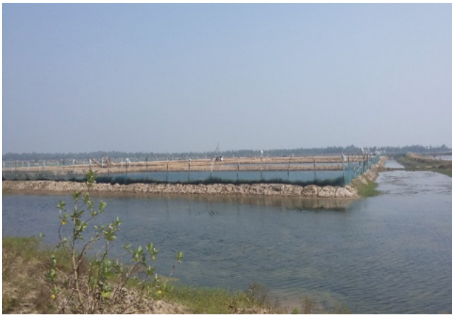
Shrimp cultivation in Padmapur, Jagatsinghpur, Odisha.