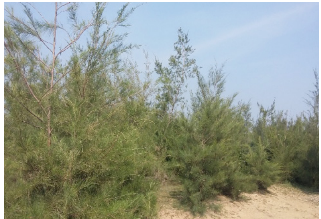
Planting of casuarina shrubs to protect from the sea waves in Jagatsinghpur, Odisha.

time we had a truckload of rice and other food items. But the rain and seawater completely destroyed the entire lot. When we returned after 30 hours we did not find anything, so to save our lives we ate green coconut, wet rice for next seven days. After seven days, the government airdropped food.” (Female, 66 years, IDI)