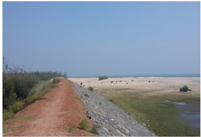
Geo-synthetic embankment wall at Padmapur, constructed by the Odisha government with support from the World Bank.

“The coastal areas...are facing drinking water problems due to saline ingression and agricultural land is also affected by salinity due to frequent floods and cyclones in the area.” (DEO, Jagatsinghpur)