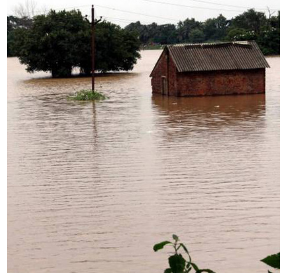
Flooding in Odisha, India.

Data for this brief are drawn from a qualitative study conducted between April and June 2017 in a rural setting in the Jagatsinghpur district of Odisha, which is highly vulnerable to floods and cyclones (Map 1). Information was collected from a range of stakeholders through 24 in-depth interviews (IDI) and two focus group discussions (FGD). IDIs were conducted among community members (e.g., farmers, laborers, women with children, young women without children, and the elderly and disabled), and stakeholders at the panchayat, block, district, and state levels. The FGDs were conducted separately among adult women and men in the community.